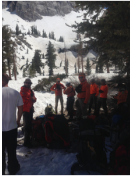
Awaiting Help Extraction (Outpost Camp)