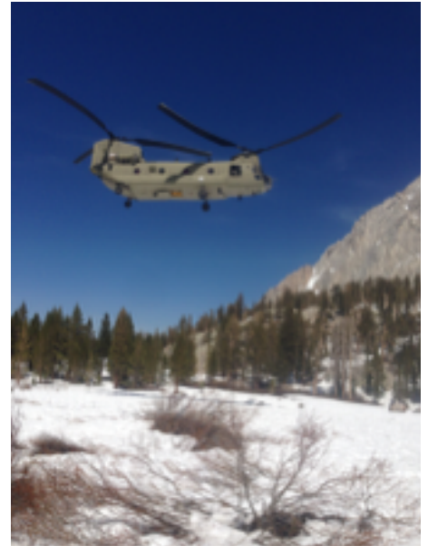
Chinook landing (Outpost Camp)