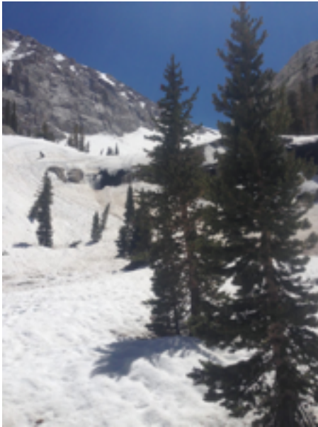
Outpost Camp waterfall