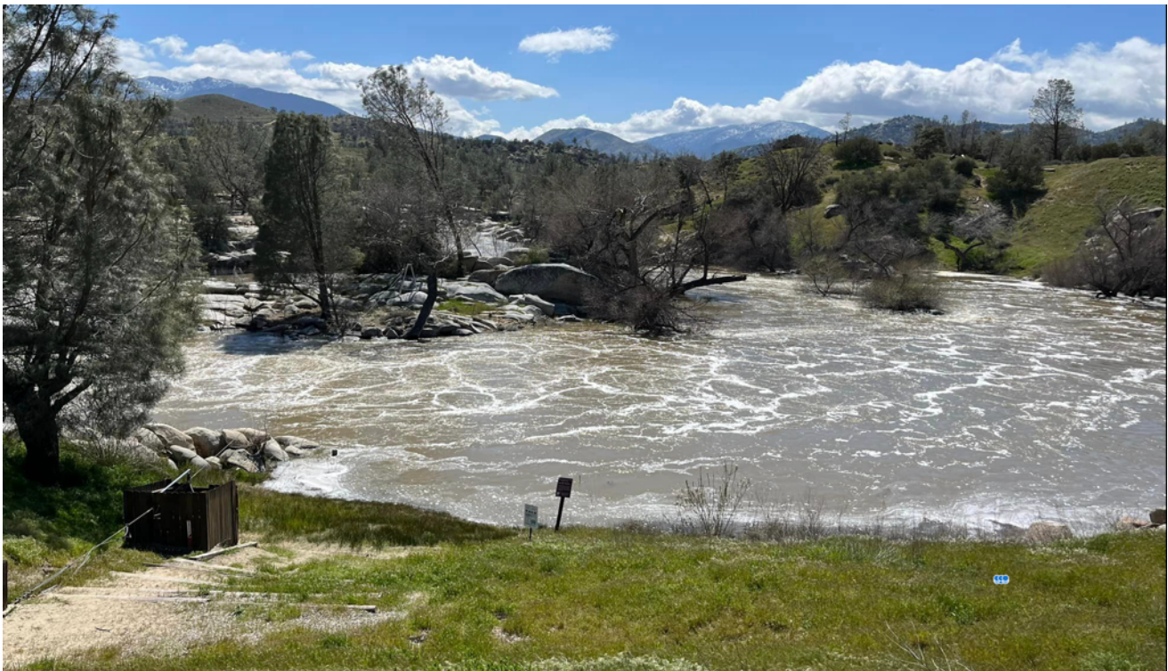
This is why we spent a lot of time helping Kern Valley SAR people. This is the usually quiet Kern River running at over 6500 cfs just below the Isabella Dam. Normally it's around 16-1800 cfs. Isabella dam went from 36,400 af to 540,000 af, but they've dropped it down to 400,000 af. It looks like a real lake/reservoir now! CDEC, ISB

We've been very busy! Sorry this edition is so late, but operations reports are still coming in... like 3 teams out in one weekend! 15 calls this period.