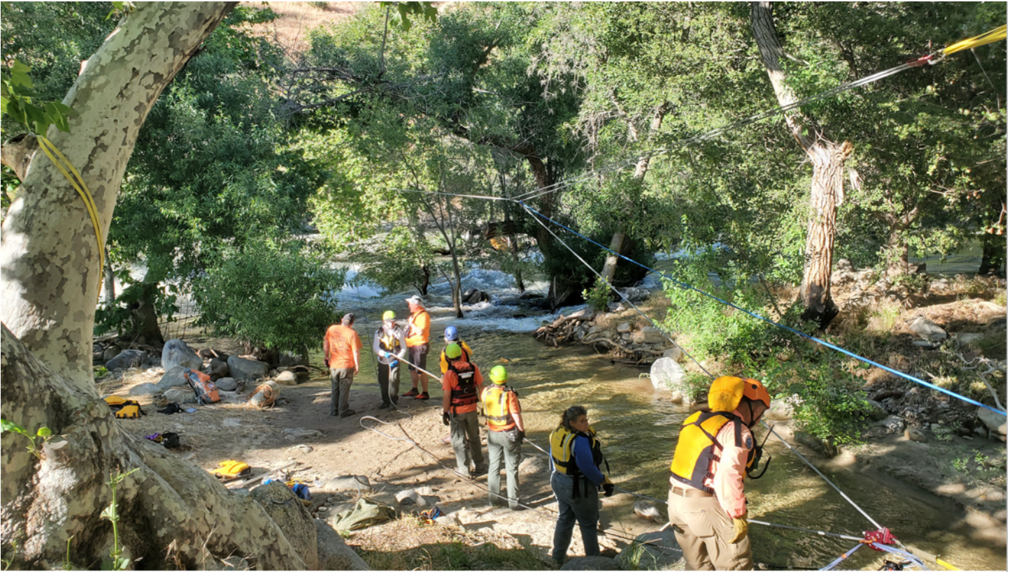
A high line was rigged so the kids who were trapped on the island could be brought across the river and not have to be in the water. Slick! Good thing CLMRG has a lot of ropes! Superior engineering!